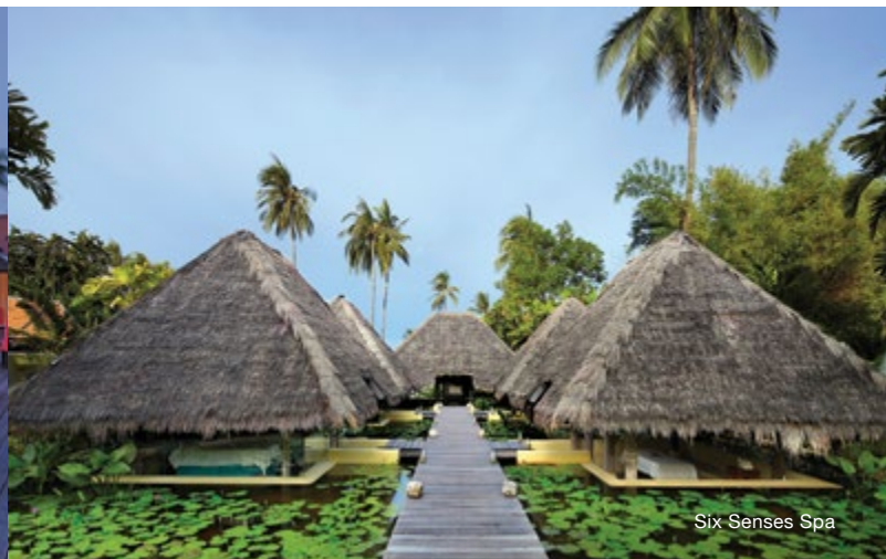
Six Senses Spa