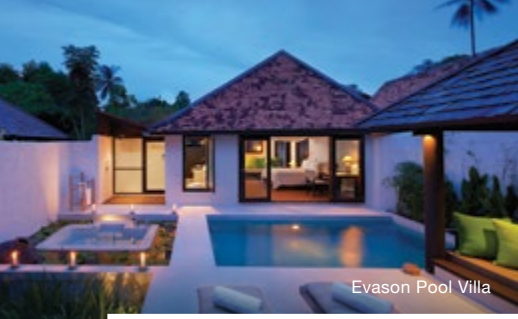
Evason Pool Villa